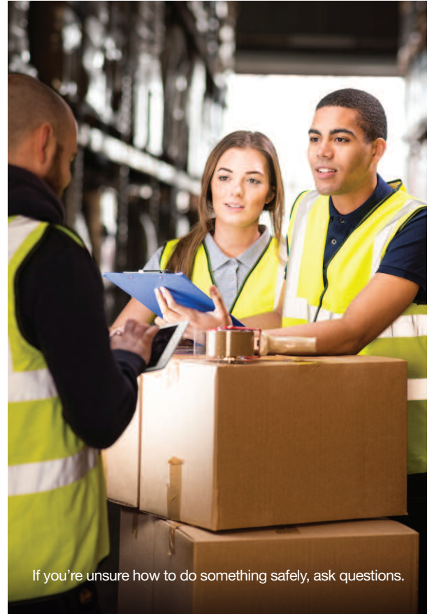
If you're unsure how to do something safely, ask questions.

about health and safety standards in the workplace. By law, you have three basic rights under The Saskatchewan Employment Act: