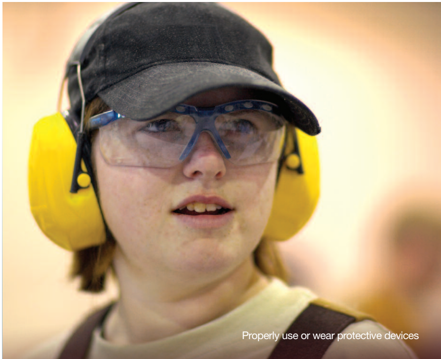
Properly use or wear protective devices

Everyone in the workplace is legally responsible for workplace safety. Before you start a new job, you should know